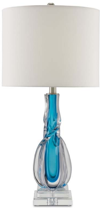
Antwerp Table Lamp