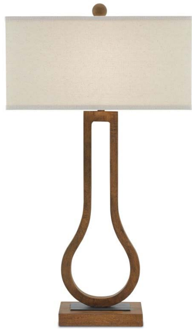
Faraday Table Lamp

The Gallerist Folding Screen was designed with bold geometric shapes created with Raj Mirror and wrought iron. A new pendant, a wall scone, and a rectangular chandelier complete the collection.