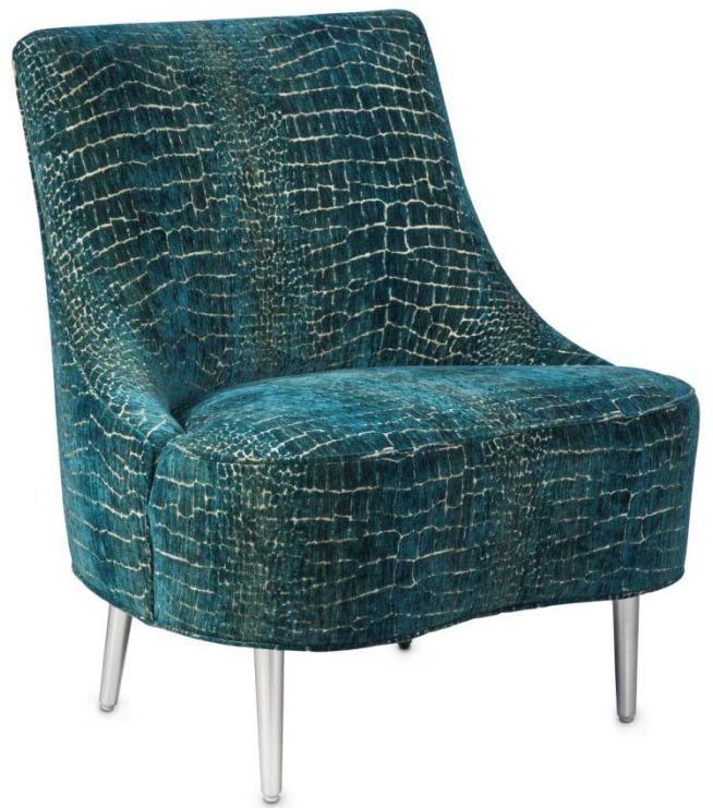
Tear Drop Chair | The Dunbar Collection

The Antwerp Table Lamp is avante-garde and organic in form, featuring a curved blown glass body and with a brilliant surge of cerulean blue at its center. The lamp sits on a clear optic crystal base topped with an off-white Shantung shade. The Faraday Table Lamp is a sculptural, yet simple piece with a Chestnut finish and linen shade.