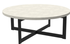
458-03 ROUND COCKTAIL TABLE W42 D42 H16 SUGGESTED MSRP: $2393