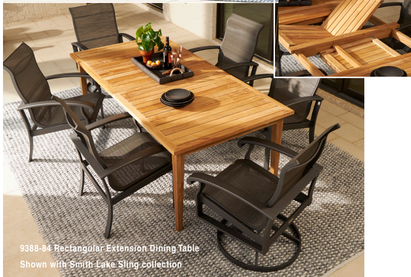
9388-84 Rectangular Extension Dining Table Shown with Smith Lake Sling collection