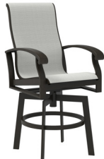
418-53 SWIVEL BAR STOOL W30 D30 H52 ARM H38 SEAT: W21 D20 H30 Swivel Base SUGGESTED MSRP: $2211