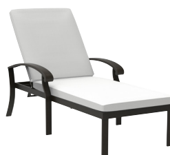
419-40 ADJUSTABLE CUSHION CHAISE W33 D77 H39 ARM H23 SEAT: W28 D48 H17 SUGGESTED MSRP: $2805