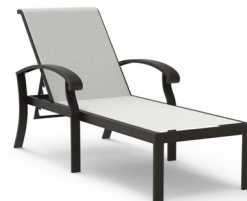
418-40 ADJUSTABLE CHAISE W29 D79 H41 ARM H23 SEAT: W24 D48 H15 4 Position reclining back. Lays flat. SUGGESTED MSRP: $2211