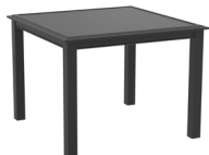
457-40 DINING TABLE