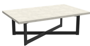
458-30 RECTANGULAR COCKTAIL TABLE W48 D30 H16 SUGGESTED MSRP: $2393