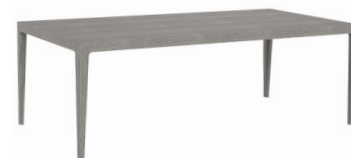
9370-88 RECTANGULAR DINING TABLE W88 D44 H30 Seats 6. 2" Umbrella hole. SUGGESTED MSRP: $4219