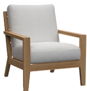
389-01 LOUNGE CHAIR W35 D31 H38 ARM H24 SEAT: W25 D20 H18 SUGGESTED MSRP: $3222