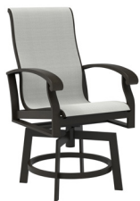
418-43 SWIVEL COUNTER STOOL W30 D30 H46 ARM H32 SEAT: W21 D20 H24 Swivel Base SUGGESTED MSRP: $2211