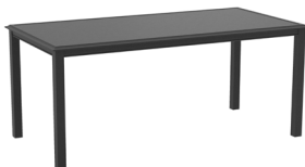
457-83 COUNTER DINING TABLE