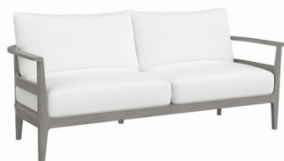
370-03 SOFA W80 D30 H36 ARM H26 SEAT: W72 D18 H17 SUGGESTED MSRP: $5382