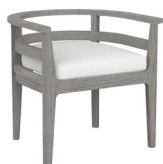
370-79 DINING ARM CHAIR W27 D24 H27 ARM H27 SEAT: W20 D22 H20 SUGGESTED MSRP: $1890