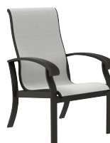
418-79 HIGH BACK DINING ARM CHAIR W26 D29 H39 ARM H25 SEAT: W21 D20 H18 SUGGESTED MSRP: $1485