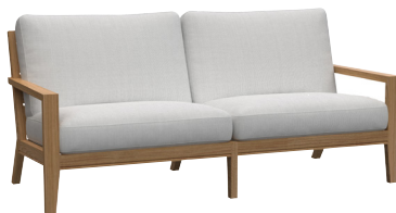
389-03 SOFA W81 D31 H38 ARM H24 SEAT: W75 D20 H18 SUGGESTED MSRP: $6300