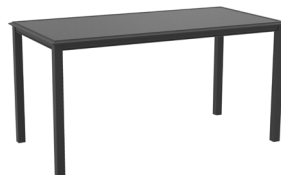
457-85 BAR DINING TABLE