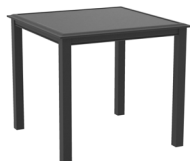
457-39 COUNTER DINING TABLE