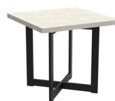
458-22 SQUARE END TABLE W24 D24 H22 SUGGESTED MSRP: $1650