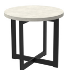
458-02 ROUND END TABLE W24 D24 H22 SUGGESTED MSRP: $1650