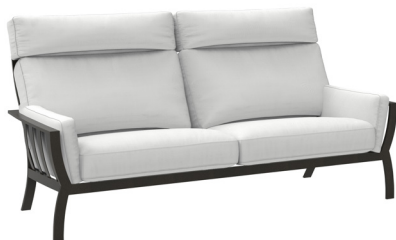
419-33 LUXE SOFA W87 D38 H44 ARM H25 SEAT: W73 D21 H18 SUGGESTED MSRP: $5594