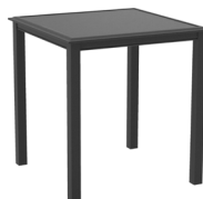
457-41 BAR TABLE