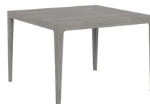
9370-44 DINING TABLE W44 D44 H30 Seats 4. 2" Umbrella hole. SUGGESTED MSRP: $2532