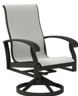
418-46 HIGH BACK SWIVEL DINING CHAIR W26 D29 H39 ARM H25 SEAT: W21 D20 H18 Swivel Base SUGGESTED MSRP: $2228