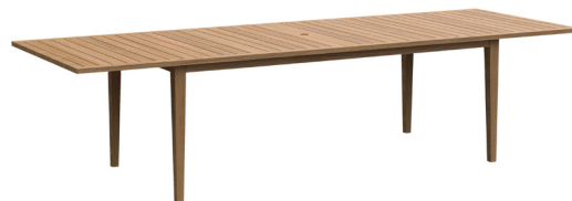
9388-84 RECTANGULAR EXTENSION DINING TABLE TWO 18" LEAVES WITH BUILT-IN SELF STORAGE OVERALL: W84 D42 H30 - Seats 6. EXTENDED: W122 D42 H30 - Seats 8-12 depending on dining chair selections. 2" Umbrella hole SUGGESTED MSRP: $5607