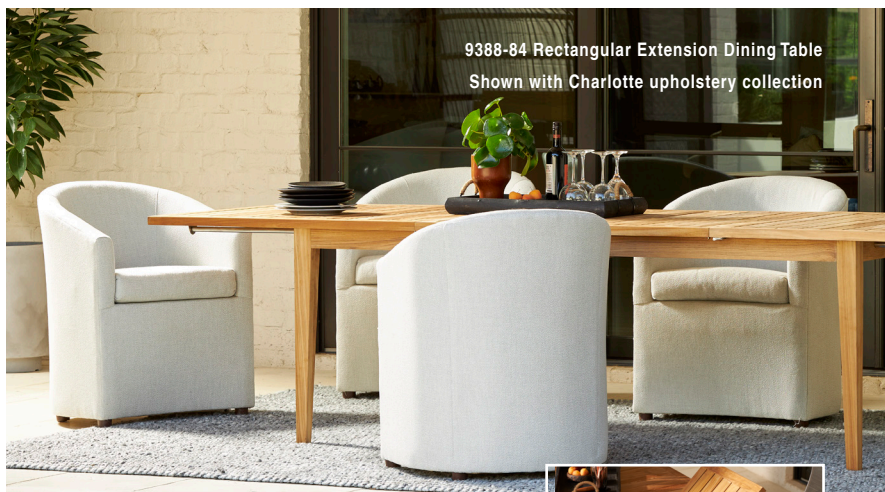
9388-84 Rectangular Extension Dining Table Shown with Charlotte upholstery collection

Architecturally inspired form meets function for today's lifestyle. Featuring simple linear styling, the occasional tables are scaled to complement lower, more modern seat heights.