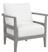
370-01 LOUNGE CHAIR W32 D30 H36 ARM H26 SEAT: W24 D18 H17 SUGGESTED MSRP: $2862