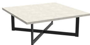
458-23 SQUARE COCKTAIL TABLE W42 D42 H16 SUGGESTED MSRP: $2393