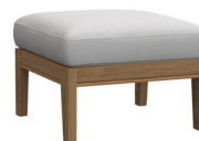
389-05 OTTOMAN W25 D25 H17 SUGGESTED MSRP: $1350